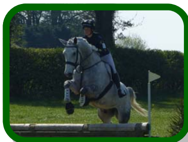
2nd - Victoria and Governor